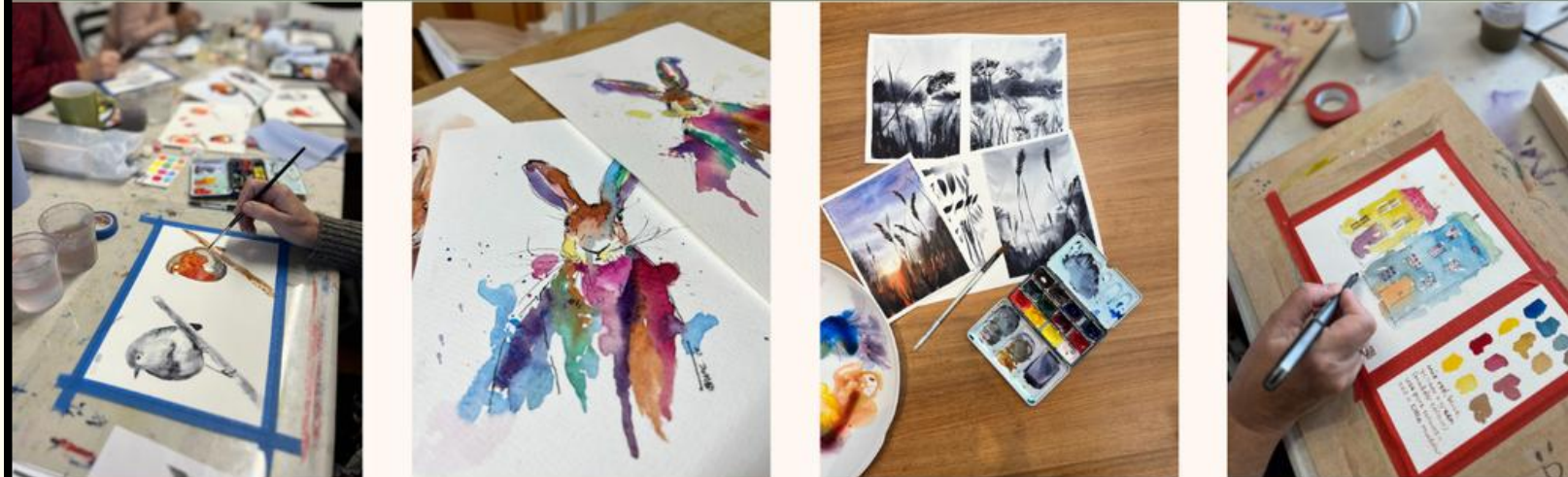
Images from previous courses

Join me for our next relaxed and supportive block of watercolour sessions.